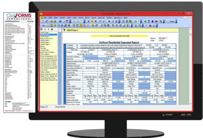
Tape the long monitor version for easy viewing